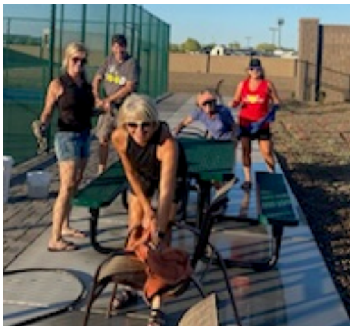
Volunteers working at the North Courts

BOD Meeting May 22nd, 3 pm. In the Milan Room @ Tuscany Falls