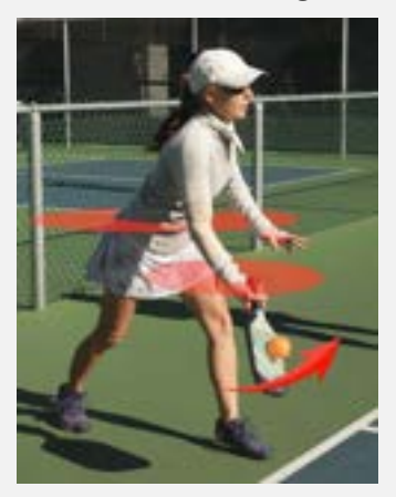
Figure 4-3(legal serve)