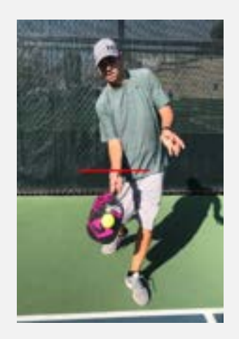
Figure 4-1(legal serve)