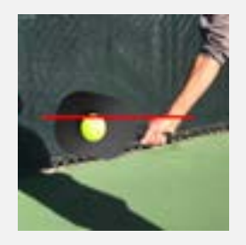
Figure 4-2(illegal serve)